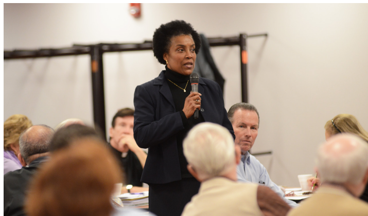
Lots of questions and lively discussions surfaced during the Faith In Our Future Cohort training sessions held in mid-March throughout the four-county Diocese. Here, a Burlington County parish core team member takes the microphone during the session held in St. Isaac Jogues Parish, Marlton. For full coverage of this training session, visit TrentonMonitor.com and click on NEWS>OUR DIOCESE .